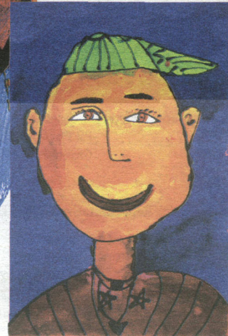
Artwork by students at Sabin Elementary School raises money for the school's art program.