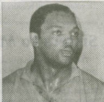
Seminary Student Jesse Jackson leads marches against segregated Chicago housing and schools in the summer of 1966.