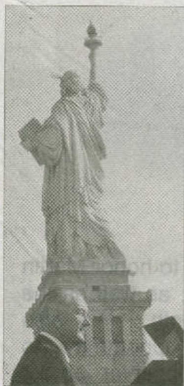
LBJ at a ceremony celebrating the Immigration Reform Act on October 3rd, 1965. By repealing race-based quotas on foreign applicants, President Johnson declares, American law "will never again shadow the gate to the American nation with the twin barriers of prejudice and privilege."