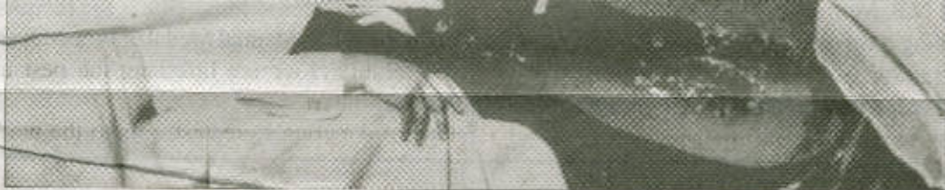
After a week of political upheaval, King watches from Selma as President Lyndon Johnson endorses the voting-rights movement in a speech to Congress.