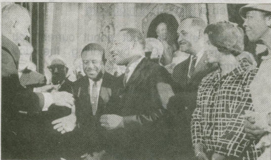
The Voting Rights Act on August 6, 1965, where LBJ shakes hands with Abernathy and King.