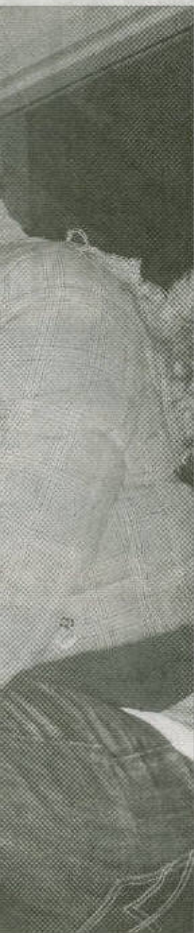
THE PORTLAND OBSERVER to achieve a suc- community College's

in 2000 as a model to serve out-of-school youth between the ages of 16-20. The program is funded by the Bill & Melinda Gates Foundation and has grown from its original site in Portland to over 13 sites around the country.