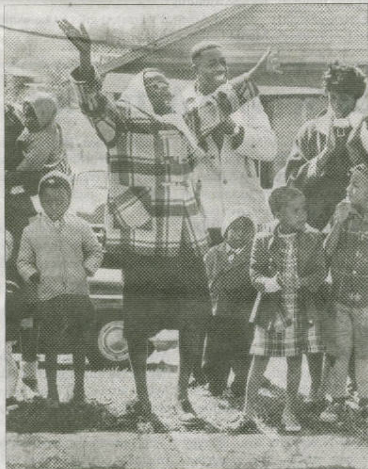
Jubilant local residents greet the procession from the Selma march along Highway 80.